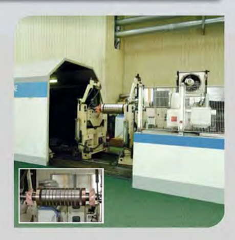
All rotors are balanced at operating speed using a high speed balance machine ensuring low vibration.

For more information, please contact a WorldWide / HYUNDAI ANEMA motor expert today: