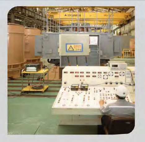
The most stringent testing processes ensure a high level of quality on every motor.