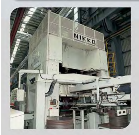
Precise control of core assembly to minimize noise and vibration.

The large motor factory of Hyundai is fully equipped with modern equipment and testing facilities.