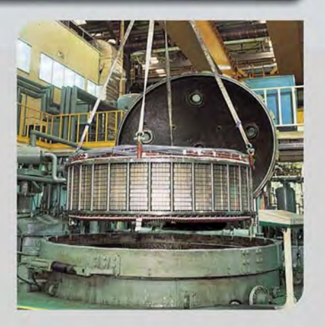
Thermal life time of insulation system meets IEEE 275's standard.

Our quality insulation system is the backbone of reliability. Every rotor is designed and built for severe duty applications using only copper bars, no aluminum die cast rotors.