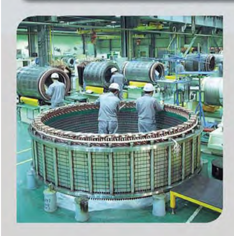
Winding assembly shop.

Our quality insulation system is the backbone of reliability. Every rotor is designed and built for severe duty applications using only copper bars, no aluminum die cast rotors.