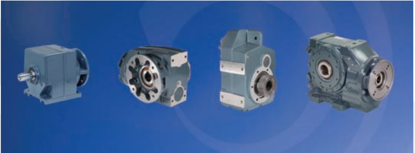
UC Helical Concentric